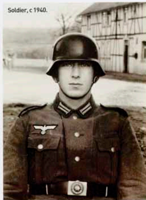
Soldier, c 1940.

Sander's origins were humble. He was born in 1876 and his father was a carpenter working in the mining industry. There was no private wealth in the Sander family. Leaving school at 14, August worked at a local mining waste tip, where he became enthralled by a photographer working at the mine. Sander's future direction and career were established and he spent his two years of military service, from 1897 to 1899, working as a photographer's assistant and doing various other photographic jobs. He was then employed to run a general commercial studio in Austria and then, in 1909, a studio in Cologne, Germany.