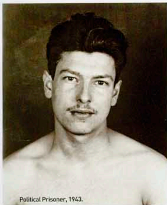
Political Prisoner, 1943.

Today, much is made of Sander's 'objective' approach. His magnum opus was a typology according to the original meaning of the word – in that it is a process of cataloguing 'types'. Sometimes we are told the name of his subject and other times merely their societal position: secretary, coal heaver etc, so they are depersonalised. However, it could not be termed a 'photographic typology' in the sense that we have come to understand the term from the more recent Düsseldorf School. This began with Bernd and Hilla Becher cataloguing gasometers, winding engines and so on, and