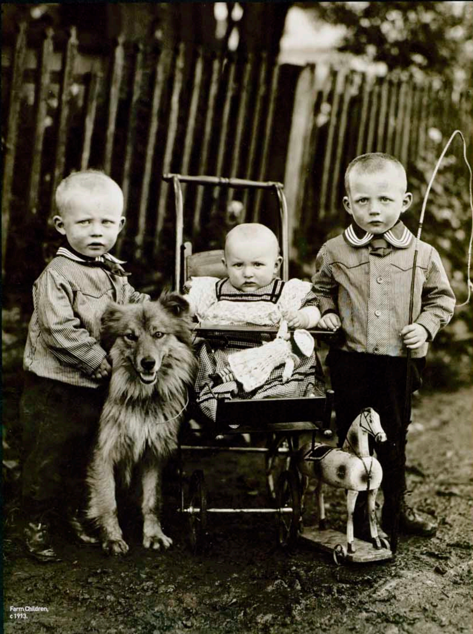
Farm Children, c 1913.